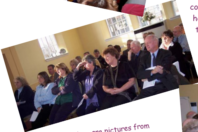
Here are pictures from some of the meetings.